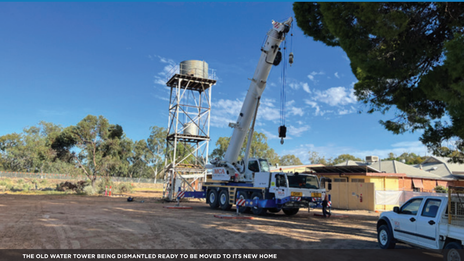
THE OLD WATER TOWER BEING DISMANTLED READY TO BE MOVED TO ITS NEW HOME